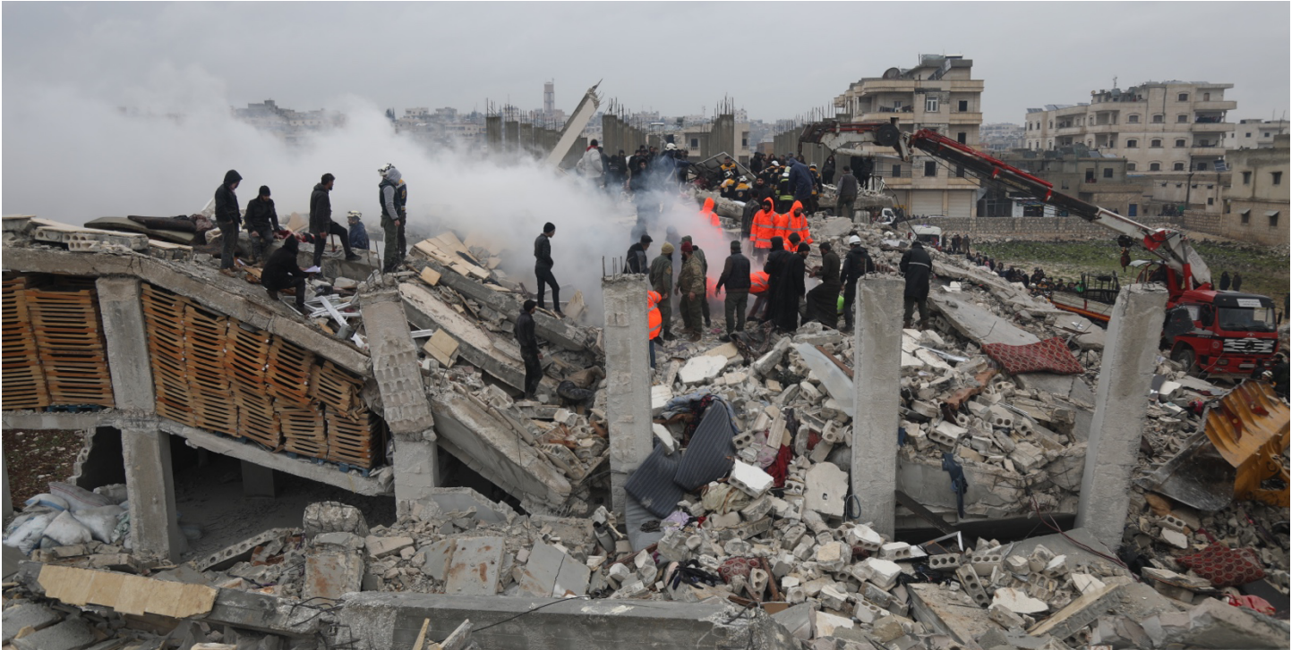
Collapsed building in Sarmada, north-west Syria. 6 February 2023.