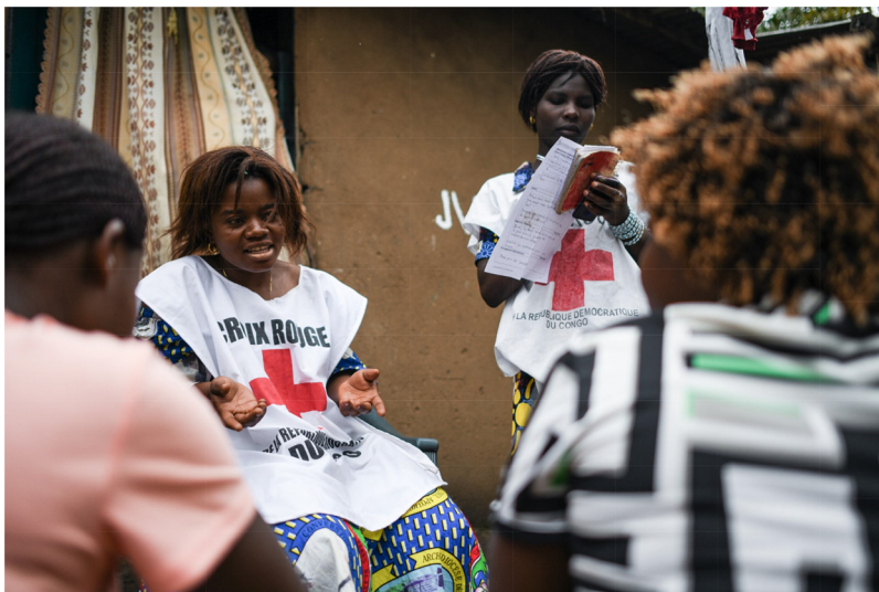
Red Cross volunteers in the Democratic Republic of the Congo talking to families in Bunia about Ebola and gathering information about their questions and concerns. These types of interactions will help improve how humanitarian actors, including Red Cross, address community concerns.

was performed using a bilingual Excel spreadsheet containing preprogrammed drop-down coding menus. CDC scientists coded the feedback in the first months of the collaboration and then trained Red Cross volunteers and IFRC staff to code. From that time forward, the first round of coding was performed by Red Cross volunteers and IFRC staff in DRC in French, and then all codes were reviewed by CDC coders, with 20% being reviewed by senior CDC coders. Discrepant codes and potential adjustments to the coding scheme were discussed and resolved on weekly French-language conference calls.