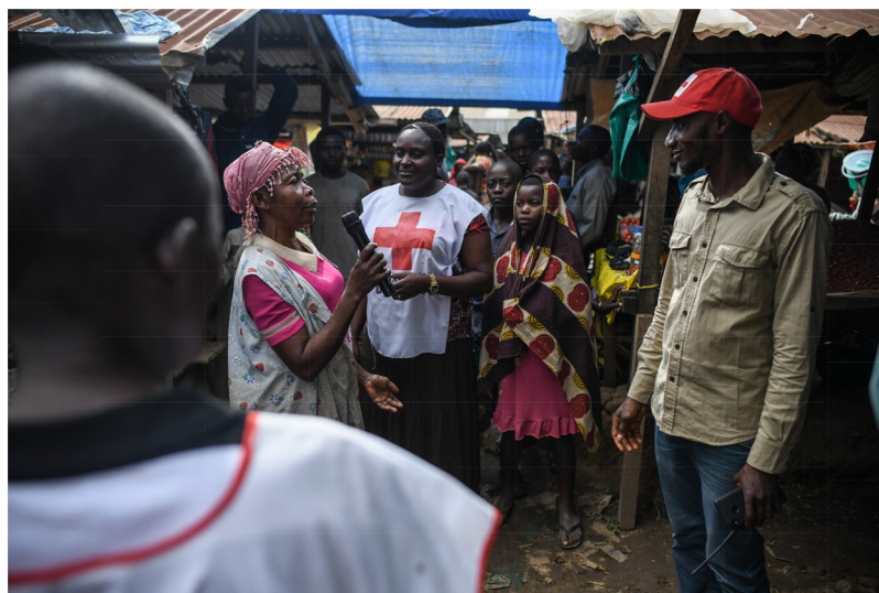
Red Cross volunteers in the Democratic Republic of the Congo provide a sensitization campaign in the biggest market in Bunia. This is a regular activity with communities, providing critical information about Ebola and how to prevent other major diseases.

could be explained by changes made in response activities.